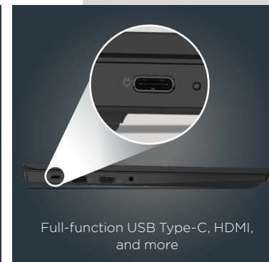
Full-function USB Type-C, HDMI, and more