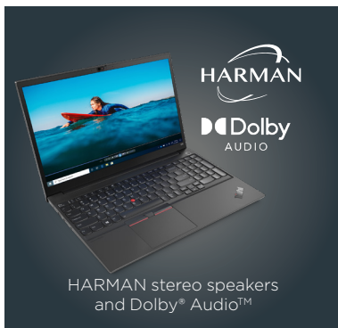
HARMAN stereo speakers and Dolby® Audio™

The data and device are safeguarded with multiple security features on the E15 Gen 3. Log in instantly with facial recognition using the IR camera, 2 or with the FPR integrated 2 on the power button. Maintain webcam privacy by simply sliding the ThinkShutter camera cover when not in use.