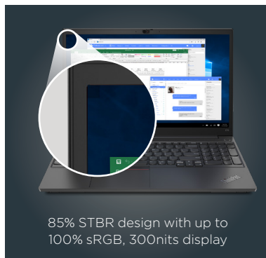
85% STBR design with up to 100% sRGB, 300nits display