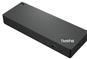
ThinkPad Universal Thunderbolt™ 4 Dock