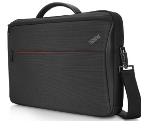
ThinkPad 14-inch Professional Slim Topload