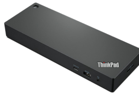
ThinkPad Universal Thunderbolt™ 4 Dock