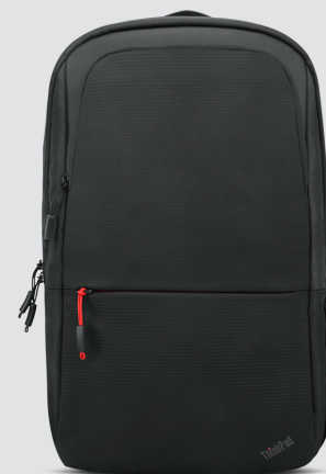
ThinkPad Essential 16-Inch Backpack (ECO) PN: 4X41C12468

The Lenovo Go USB-C ANC In-Ear Headphones are designed to deliver a clear voice and maintain productivity while on the go. Not only do these headphones produce superior sound, but they also feature 3 microphones that ensure a clear voice for calls. Lightweight, highly portable, and perfectly comfortable, the Lenovo Go USB-C ANC In-Ear Headphones also offer a multi-functional control box for easy-of-use.