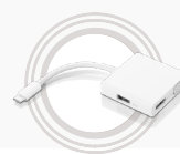
Lenovo USB-C 3-in-1 Hub