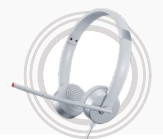
Lenovo 100 Stereo Analog Headset