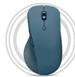
Lenovo Yoga Pro Mouse