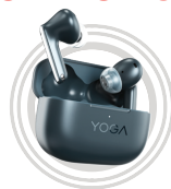
Lenovo Yoga True Wireless Stereo Earbuds