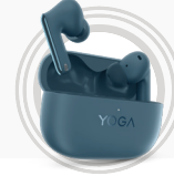
Lenovo Yoga True Wireless Stereo Earbuds