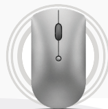
Lenovo Yoga 600 Bluetooth® Silent Mouse