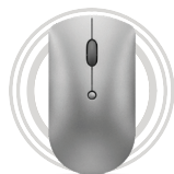
Lenovo Yoga 600 Bluetooth® Silent Mouse