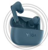
Lenovo Yoga True Wireless Stereo Earbuds