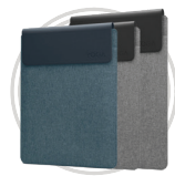
Lenovo Yoga Sleeve (14.5" and 16")

* Example of Lenovo catalogue naming convention