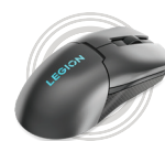
Legion M600s Qi Wireless Gaming Mouse