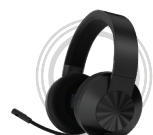
Legion H600 Wireless Headset + S600 Headset H600 Wireless Headset Stand