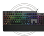
Legion K300 Mechanical Keyboard