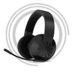
Legion H600 Wireless Gaming Headset