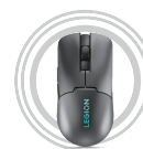
Legion M600s Qi Wireless Gaming Mouse