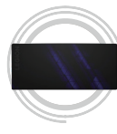
Legion Gaming Control Mouse Pad XXL