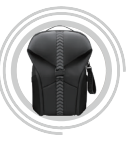
Legion 16" Functional Gaming Backpack GB700