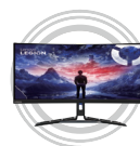
Legion Y34wz-30 Monitor