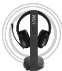
Legion S600 Gaming Station