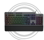
Legion K500 RGB Mechanical keyboard