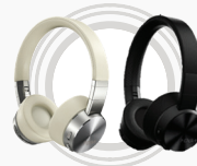
Lenovo Yoga Active Noise Cancellation Headphones