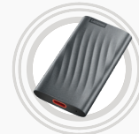
Lenovo PS6 Portable SSD