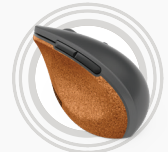
Lenovo Go Wireless Vertical Mouse