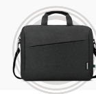
Lenovo 16" Laptop Topload T210 (ECO)