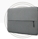
Lenovo Select 14" Sleeves