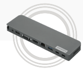
Lenovo USB-C Mini Dock