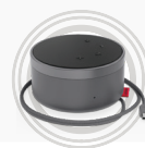
Lenovo Go Wired Speakerphone