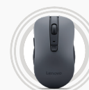
Lenovo WL310 Bluetooth® Silent Mouse