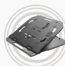
Lenovo 2-in-1 Laptop Stand