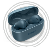
Lenovo TWS YOGA PC Edition