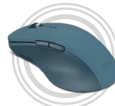
Yoga Pro Mouse