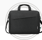
Lenovo 16" Laptop Topload T210 (ECO)