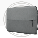
Lenovo Select 14" Sleeves