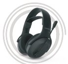
Legion H410 Wireless Gaming Headset