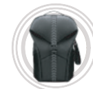
Legion 16" Functional Gaming Backpack GB700