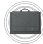
Lenovo Yoga Tote Sleeve