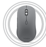
Lenovo Yoga Bluetooth Silent Mouse