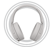
Lenovo Headphone Yoga PC Edition